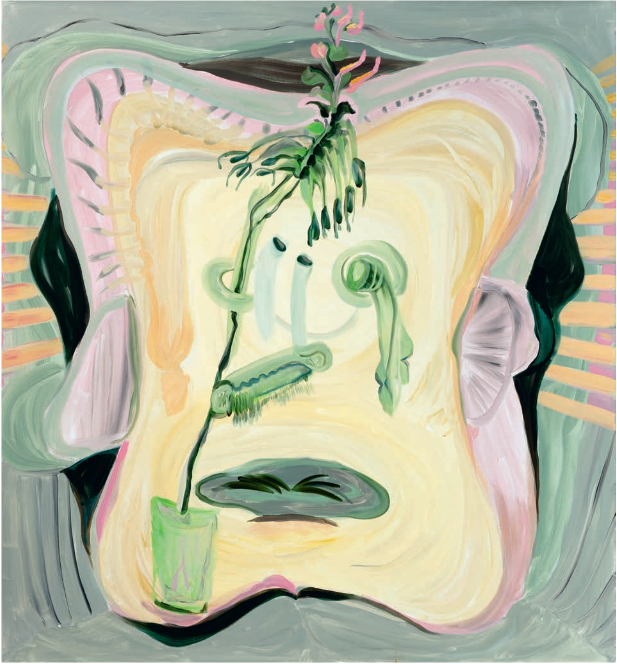
Seven Senses # 2, acrylic on linen, 130 x 120 cm, 2019