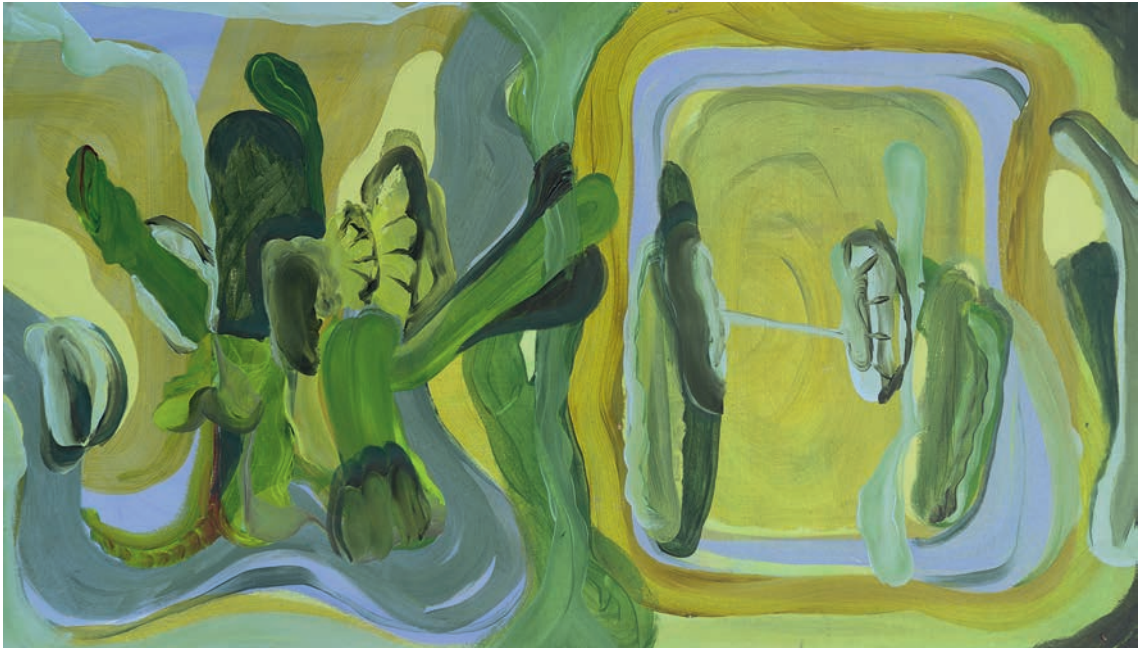
How to communicate, acrylic on wood, 39 x 70 x 2 cm, 2021