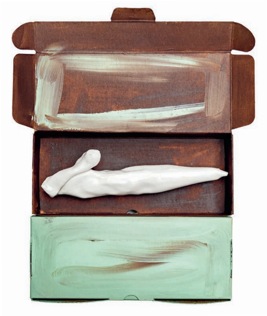
Treasure box # 2, acrylic on cardboard / porcelain, 25 x 17 x 3 cm, 2020