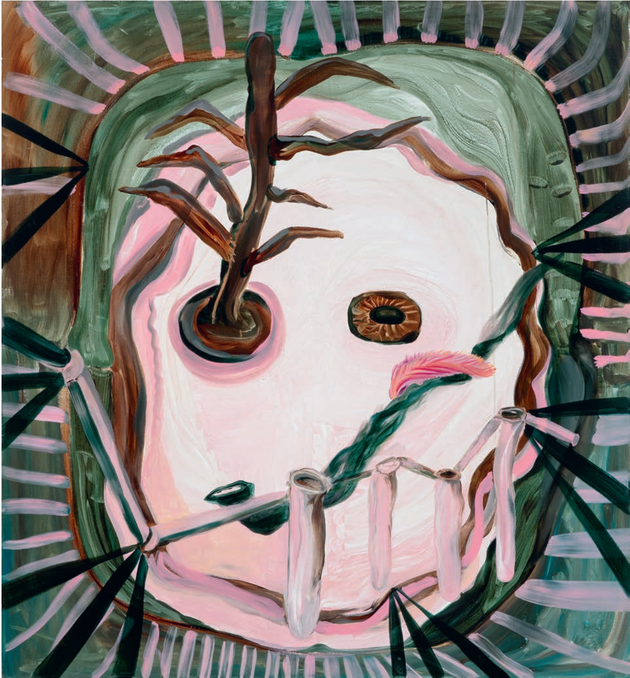
Seven Senses # 1, acrylic on linen, 130 x 120 cm, 2019