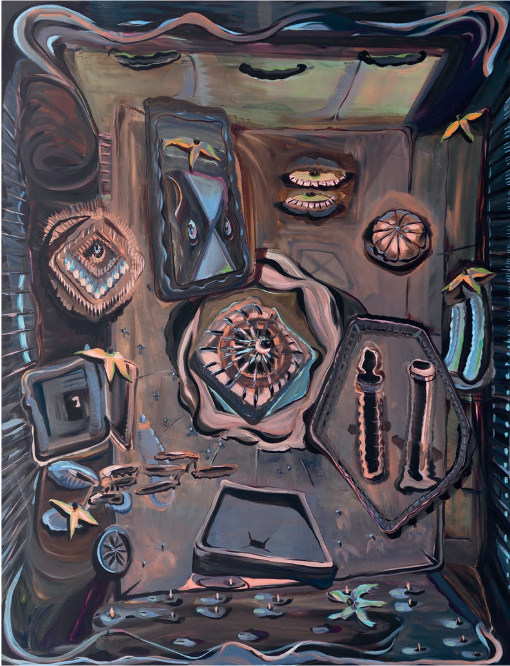
Treasures in a box, oil on canvas, 170 x 130 cm, 2022