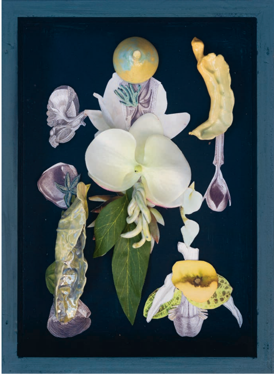
It's hard to see the true for real # 8, mixed media, 32 x 23 x 4 cm, 2023