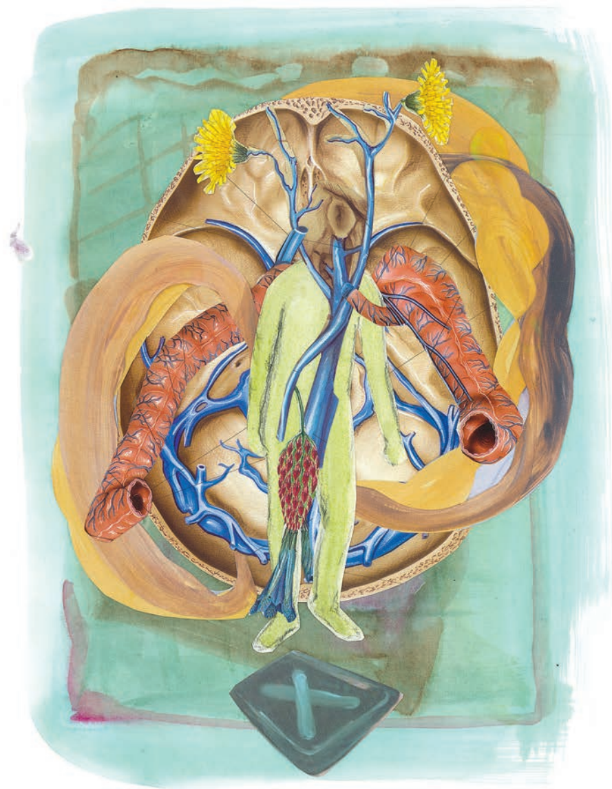
It's hard to see the true for real # 1, mixed media, 34 x 28 cm, 2021