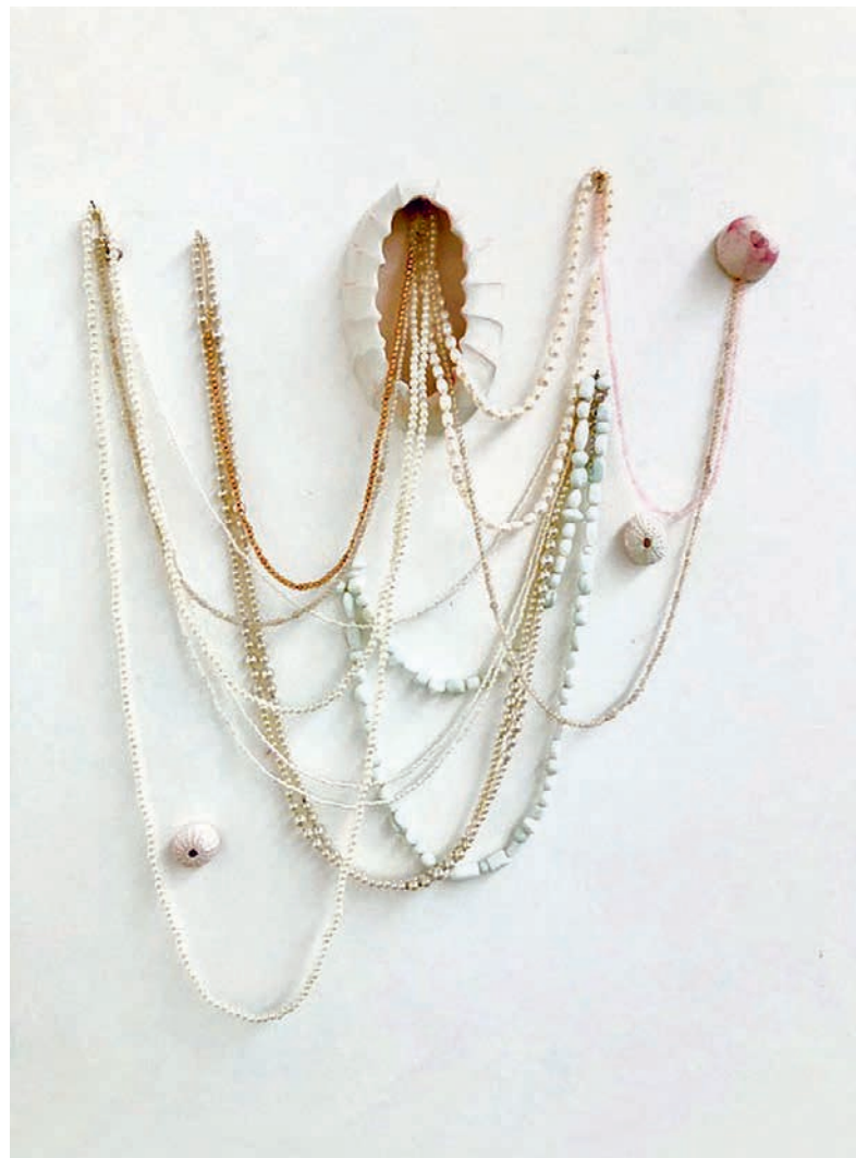
Noli me tangere # 2, porcelain, 100 x 100 cm, 2020