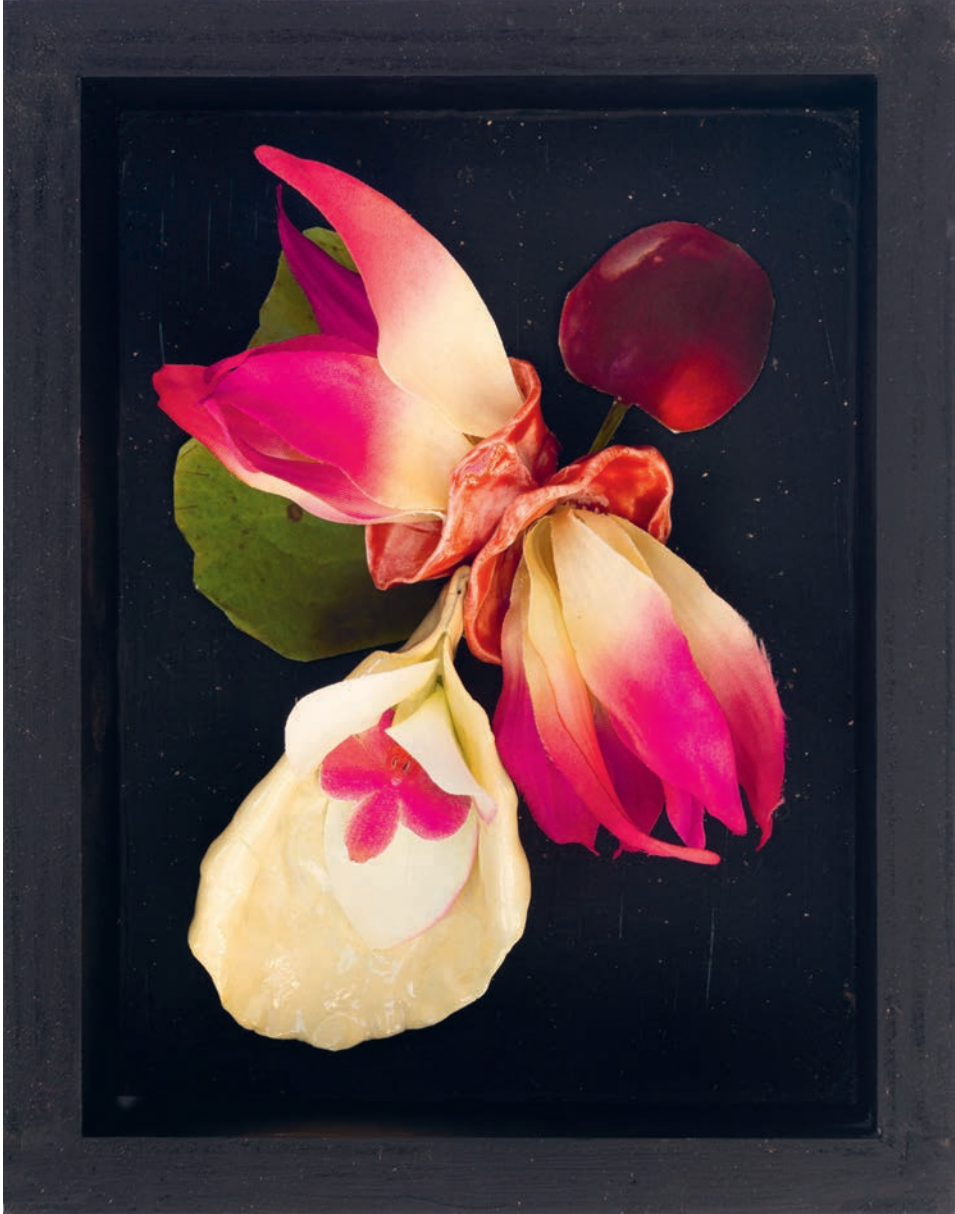
It's hard to see the true for real # 11, mixed media, 27 x 19 x 4 cm, 2022