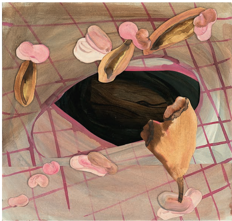
Zero zero # 2, mixed media, 30 x 28 cm, 2019