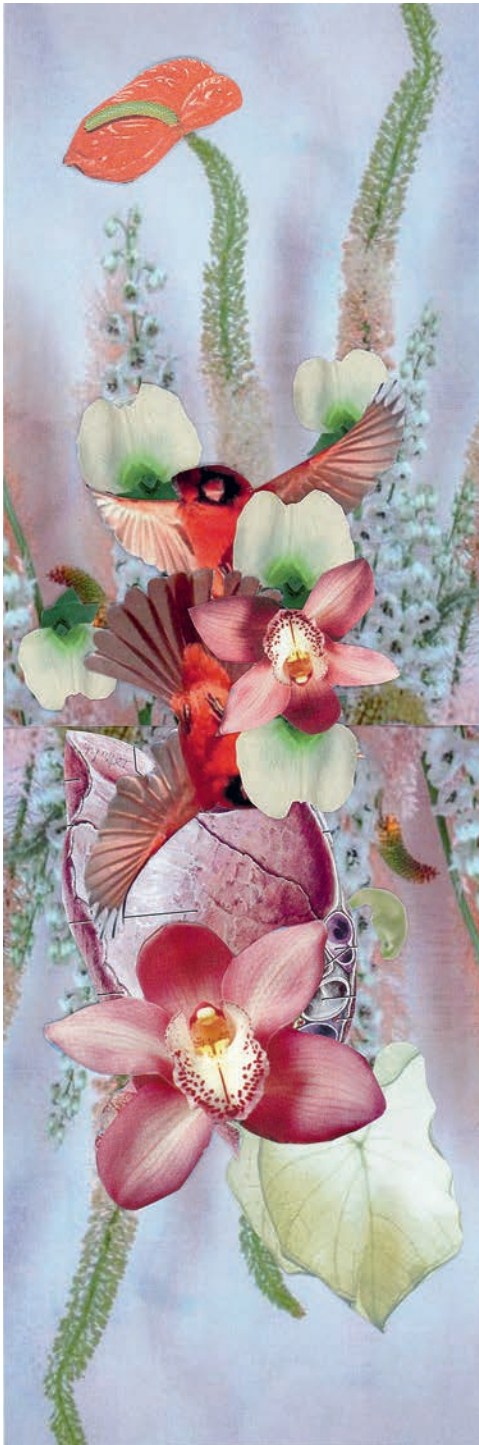
Red bird, mixed media, 42 x 14 cm, 2022