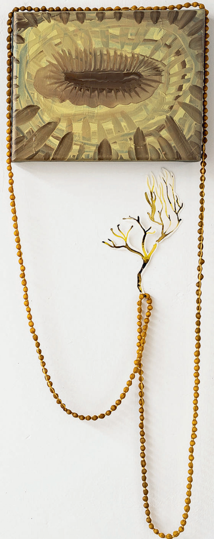
P. 94-95: Feel free to feel, installation at Big Art 2021, porcelain and small objects, 300 x 350 cm, 2021