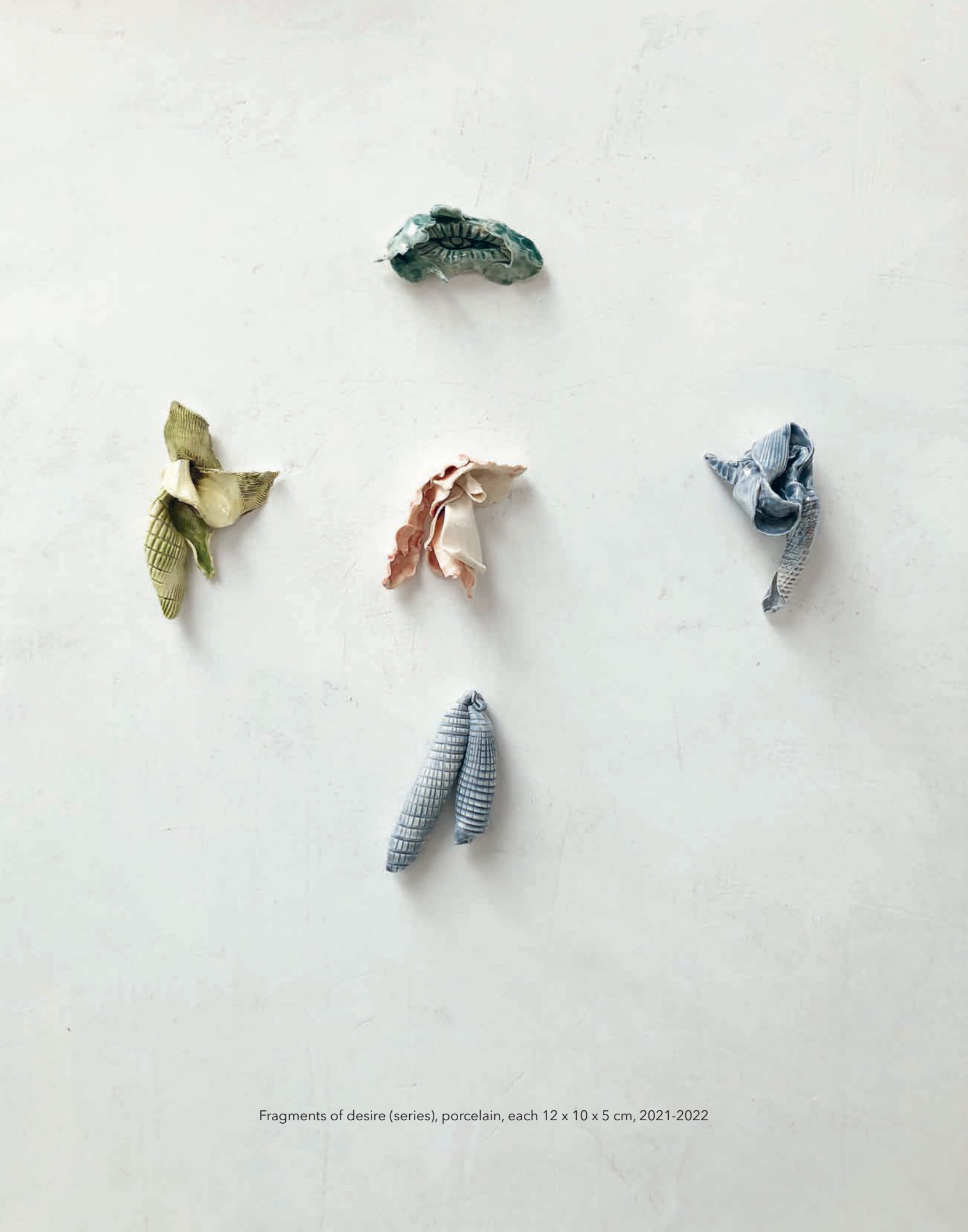
Fragments of desire (series), porcelain, each 12 x 10 x 5 cm, 2021-2022