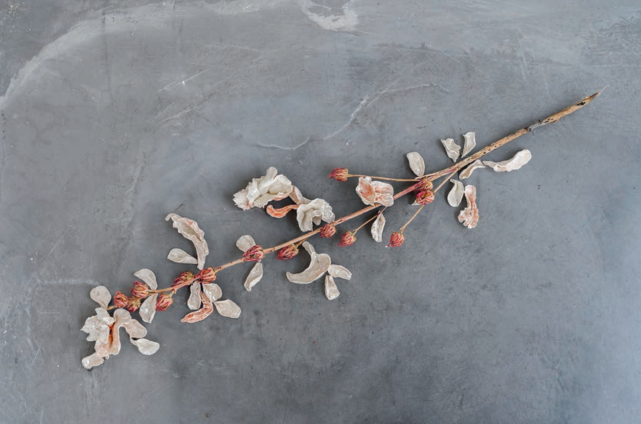
Silence, porcelain and hibiscus, 20 x 80 cm, 2021