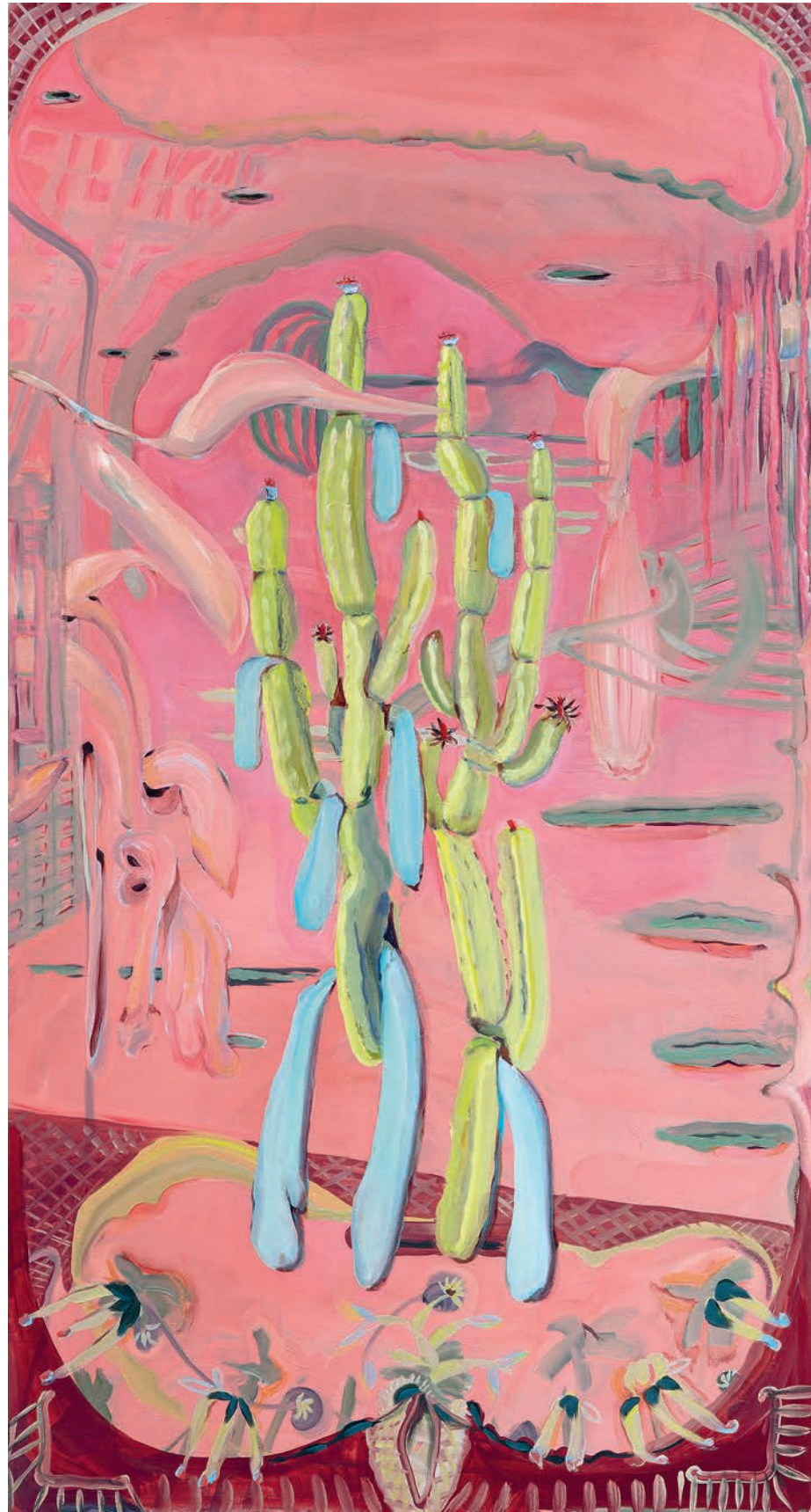
What makes you grow # 3, acrylic on linen, 190 x 100 cm, 2019