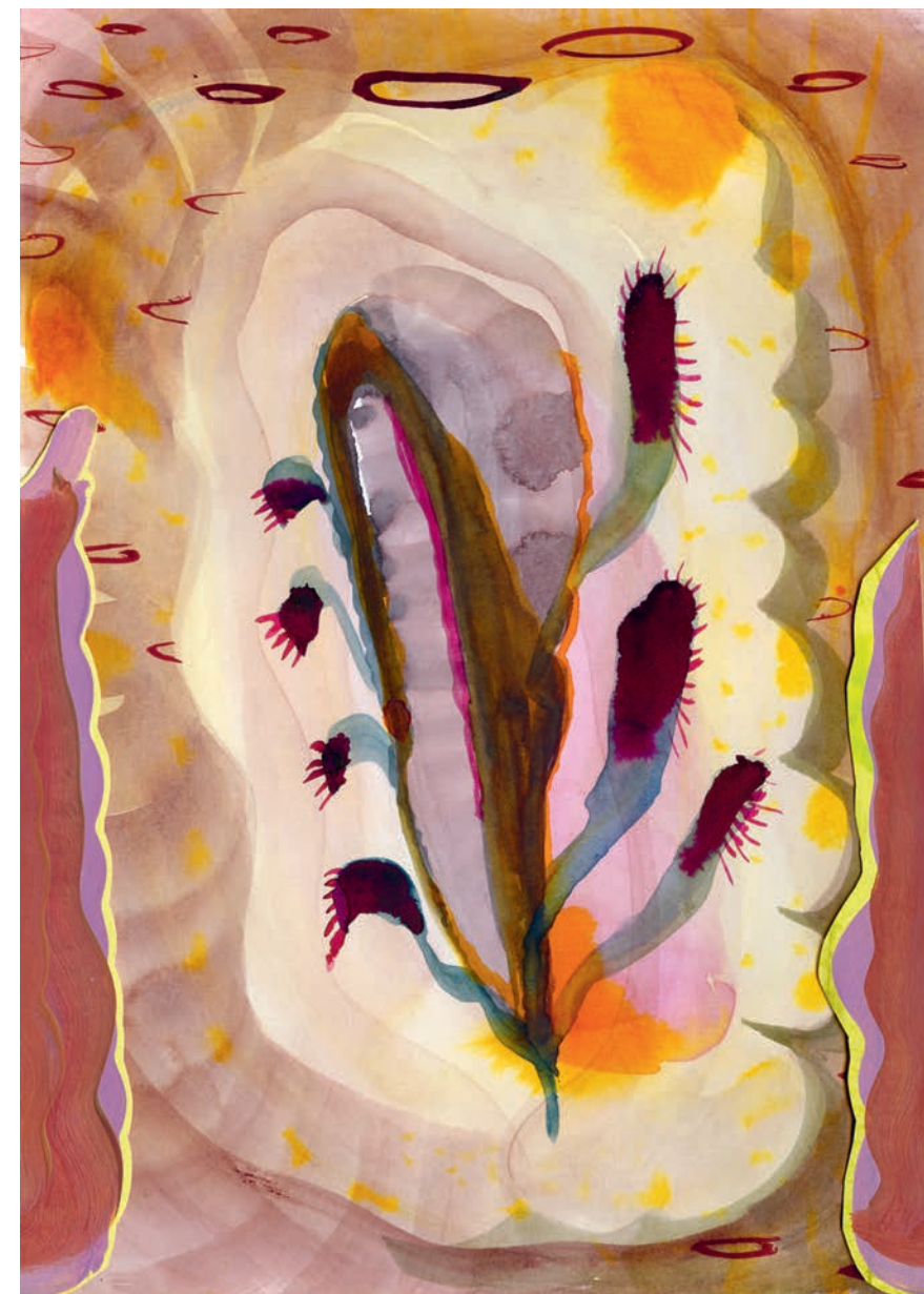
Zero zero # 1, ink and acrylic on paper, 29 x 21 cm, 2019