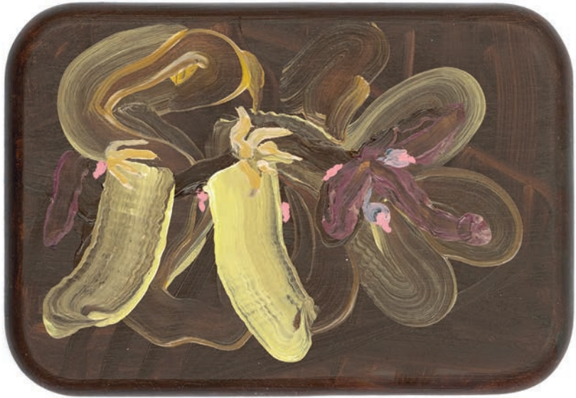
Small tray, acrylic on bamboo, 17 x 24 x 2 cm, 2019