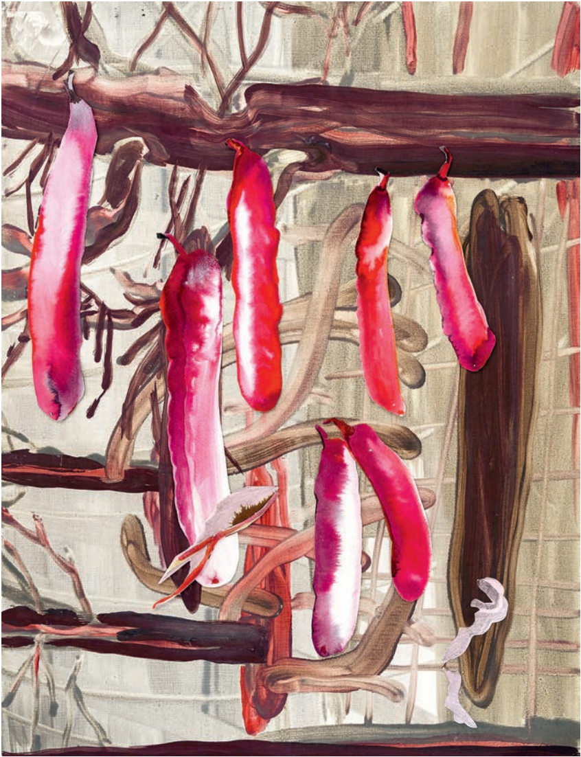
Gravity, oil and ink on paper, 65 x 50 cm, 2020