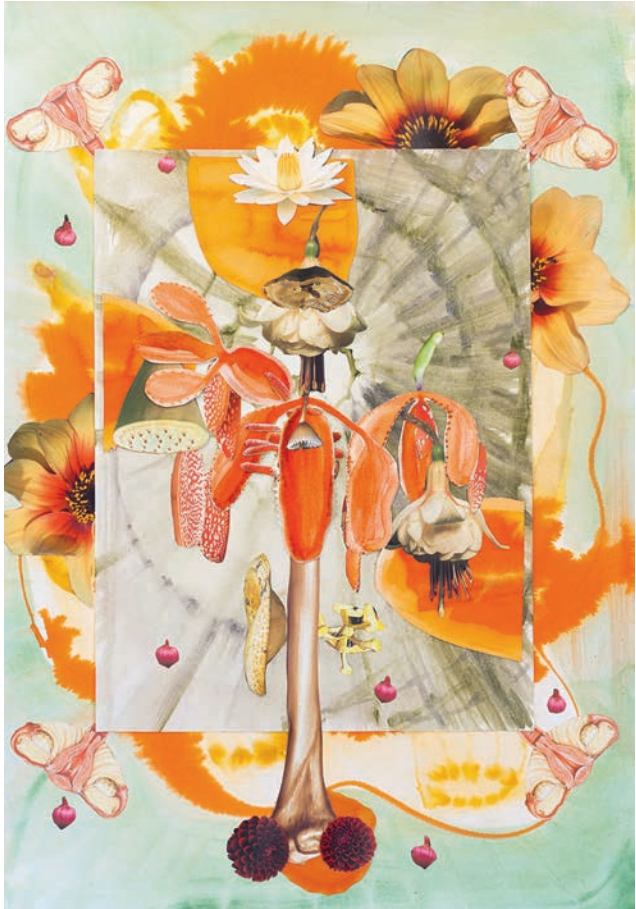
What makes you grow 5, mixed media, 32 x 24 cm, 2022