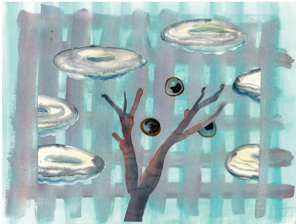
Zero zero # 4, mixed media, 30 x 40 cm, 2019