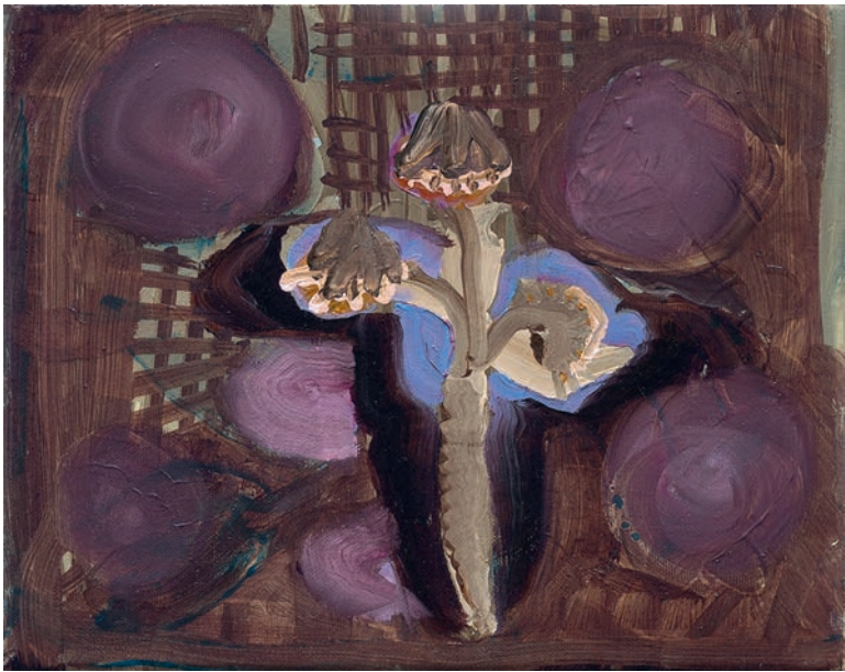
Shadows, acrylic on canvas, 24 x 30 cm, 2020