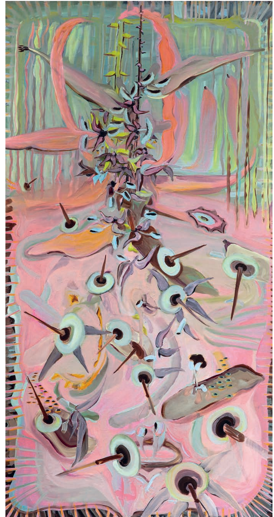
What makes you grow # 4, acrylic on linen, 190 x 100 cm, 2019