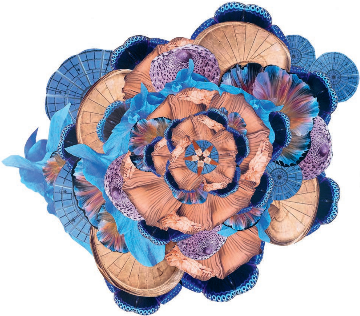
Into Fibonacci, mixed media, 45 x 55 cm, 2022