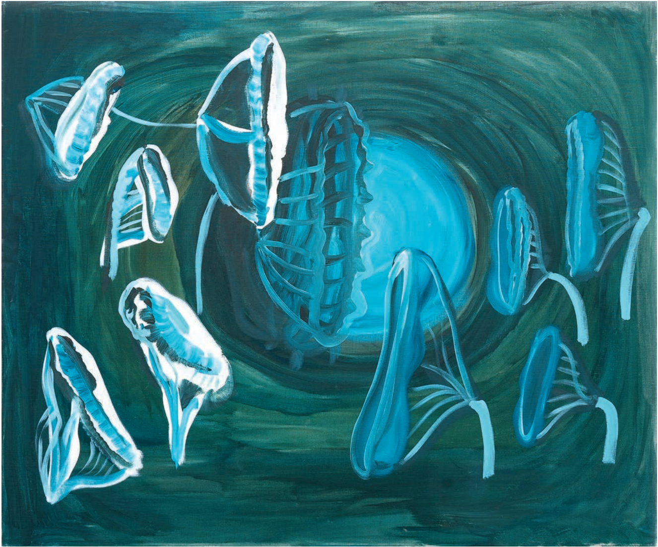
To connect with the opposite, acrylic on linen, 100 x 118 cm, 2018